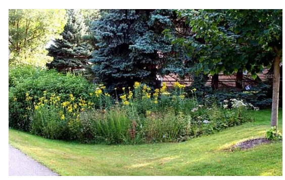
An established rain garden in bloom. Garden intercepts runoff before it reaches the impervious surface.

A summer start will work but you may need to water the plants more often until they are established. The first important step is to observe your property during heavy rains, noting where puddles are forming, which areas are not draining well, and where runoff is flowing, especially from the downspouts. Next proceed to pinpoint an exact site and decide on the size and depth required for success.